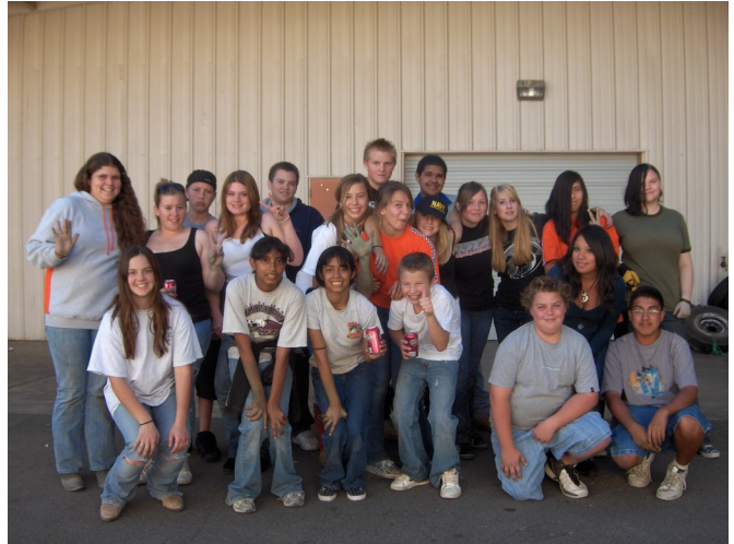
After all the hard work these green hands have got their degree! :)

Raking, hoeing, Making Facilities look amazing!