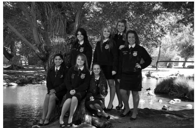
Hope You're Enjoying Apple Valley FFA! Love Your Officers. :)

Every month we hold a chapter meeting, most of our meetings are themed! Since it is the month of Halloween and the month of pumpkins, we call this meeting the pumpkin meeting. This is one of our most entertaining meetings. We have a pumpkin carving contest after all the official business is done with. You are allowed to carve whatever your heart desires into the pumpkin, but let's keep it appropriate. You will be split into groups and have so many minutes to finish your carving! The best pumpkin wins. Members bring your families and come join us at The Chapter Pumpkin Meeting! Hope To See You There.!